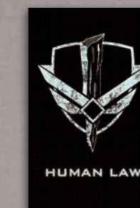
12 HUMAN LAW CARDS