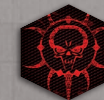
16 VAMPIRE CONTROL MARKERS