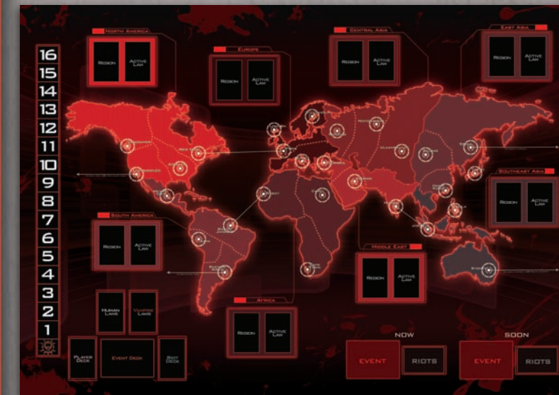
1 GAME BOARD