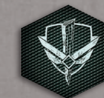
6 MARTIAL LAW TOKENS