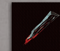
16 SYMPATHY TOKENS