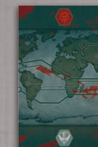
84 PLAYER CARDS