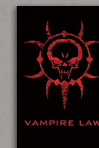
12 VAMPIRE LAW CARDS