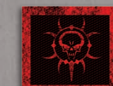
1 VICTORY MARKER