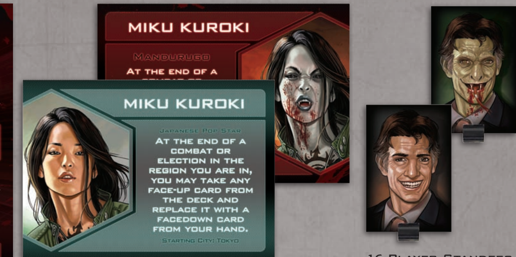
8 ROLE CARDS