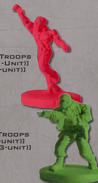
60 HUMAN TROOPS [40 TAN (1-UNIT)] [20 GREEN (3-UNIT)]