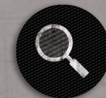
5 INVESTIGATION TOKENS