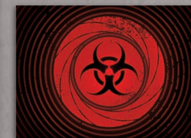
30 EVENT CARDS